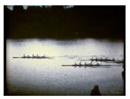
Rowing on the Nepean River

He had a similar role in the tennis clubs of the area, being the tennis champion at his high school. He also went on to be the founder and the secretary of the Emu Plains tennis club.