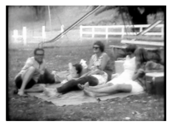
Christmas Day at Avoca Beach

The Hunter family frequently visited Avoca Beach for their holidays. They would often spend their Christmases there, for example. The Hunter family, with all the children and grandchildren included, would make the trip to the beach. As in Penrith, the Hunters would organise community events while they were in Avoca. In 1949, for example, they organised a garden party, raising funds for a local orphanage. The Hunter family was also known for their involvement with the surf life saving club at Avoca Beach.