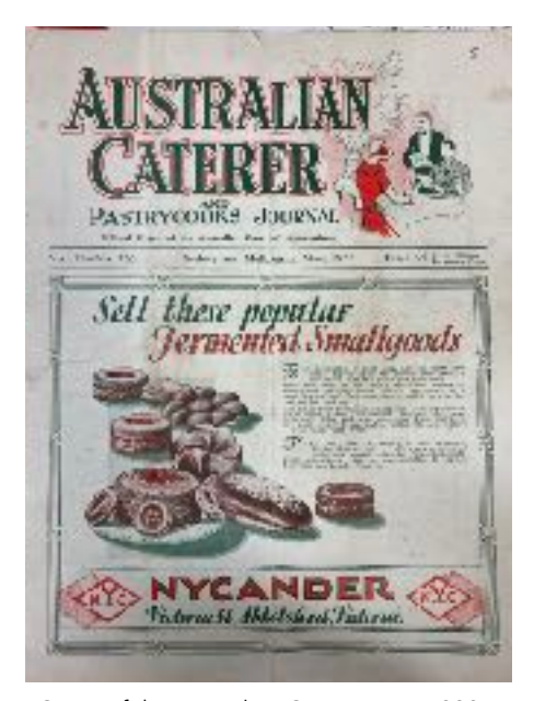
Cover of the Australian Caterer, May 1932